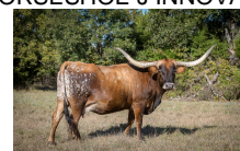
HORSESHOE J INNOVATE