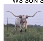
WS SUN STAR