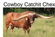
Cowboy Catchit Chex