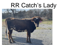
RR Catch's Lady