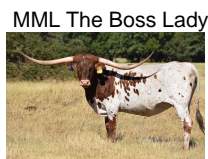
MML The Boss Lady