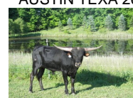
AUSTIN TEXA 260