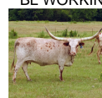
BL WORKING SIS